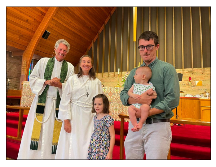
Welcoming a new baby into St. David's family.