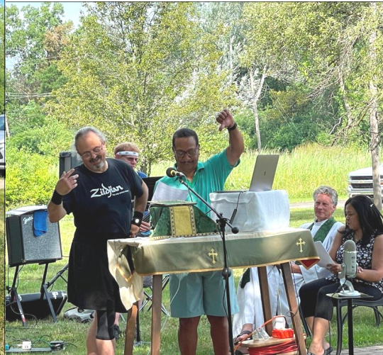
The announcements can get a little corny at times, but it's all in fun.